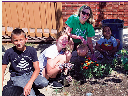
Neighborhood Art House students help keep Emmaus beautiful.