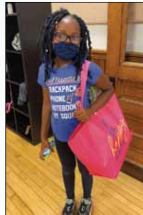
A Kids Cafe child displays her bag of gifts.