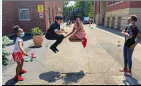
The children enjoy outdoor activities.