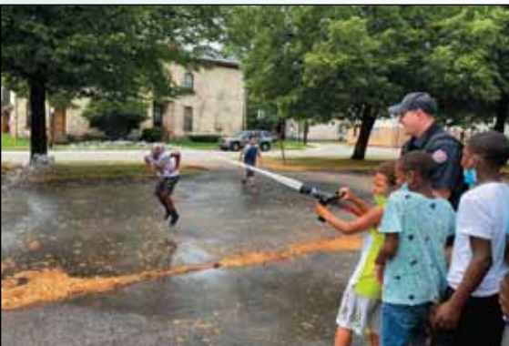
Engine 8 Firefighters enjoy time with the kids.