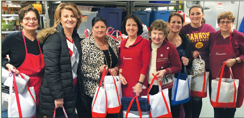
Parishioners of Assumption Greek Orthodox Church with Christmas tote bag donations