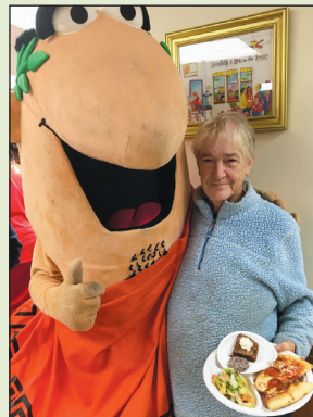
Little Caesar with a guest of the kitchen

Even corporations can participate in a revolution of the heart. Toward the end of last year, Little Caesars' Love Kitchen visited the soup kitchen and brought ninety freshly baked pizzas to guests of Emmaus and on another day, Kentucky Fried Chicken sent 250 warm, individually boxed meals. "Cooking is love made visible," someone wrote. Amen.