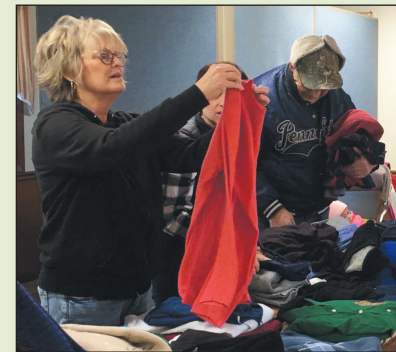
A personal shopper assisting a guest