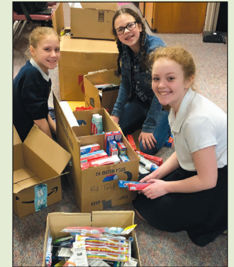
Students at St. Jude School gather donations.