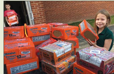
St. Luke students help to load donations for the Kids Cafe and Art House onto the Emmaus truck.

One of the best ways to begin a revolution of the heart is to start with the youngest among us.