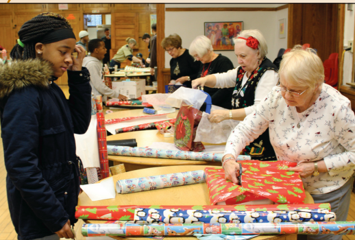
Volunteers wrap presents for children at the Kids Cafe.

How the children at the Kids Cafe look forward to the annual Christmas Store. On a Saturday morning in December they get to go shopping at the Cafe which