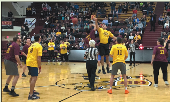
The Serve halftime game