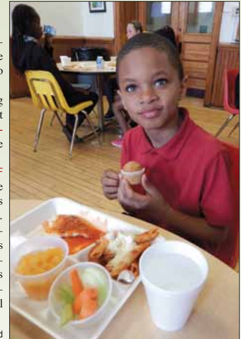
Kids Cafe child