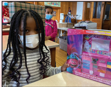
A new cosmetic set!

Every year, the Kids Cafe offers this “Christmas Store,” giving each child in the program a chance to pick out a gift for themselves, and one for each person they live with. Dozens of individuals and local businesses provided gifts, turning a room at the Kids Cafe into a “Santa’s Workshop” that left many kids speechless. Volunteers