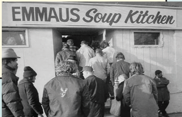
The Soup Kitchen at its former location on 6th and Parade Streets.

February 16: The poet Adrienne Rich wrote, "The decision to feed the world is the only real decision." Once you've made that decision, everything looks different, everything looks a bit clearer. It's the decision that guides every other commitment you will make throughout your life.