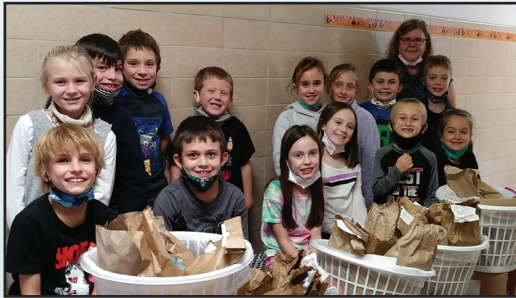
Second graders from St. Jude’s with candy donations