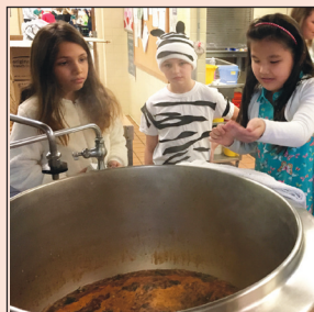
Second and third graders at St. Luke’s making minestrone soup for Emmaus Soup Kitchen