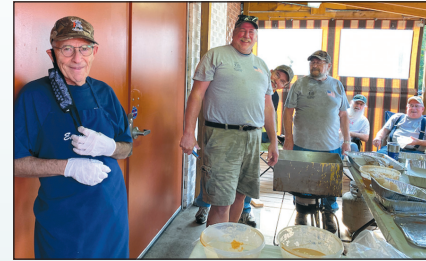
Members of SONS of Lake Erie prepare the fish fry meal on the food pantry porch.