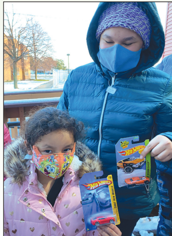
Children receive Matchbox cars with their Christmas meals.

The spirit of Christmas joy could be felt, even at a social distance, during Emmaus Soup Kitchen's annual Christmas dinner on December 18th. A special celebration that included stuffed chicken as the dinner entrée, also featured a gift giveaway as the cherry-on-top. Guests received fleece-lined hooded sweatshirts, calendars for the new year, Christmas ornaments, children's blankets for families and even Matchbox cars for kids.