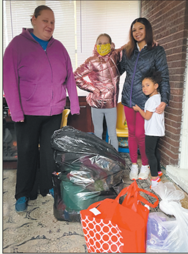
A Kids Cafe family receives its gifts.