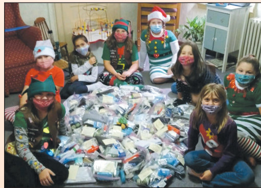
Girl Scout Troop 52924 with their donations